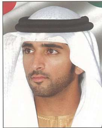
H.H. Sheikh Hamdan Bin Mohammed Bin Rashid Al Maktoum Crown Prince of Dubai and Chairman of Dubai Executive Council