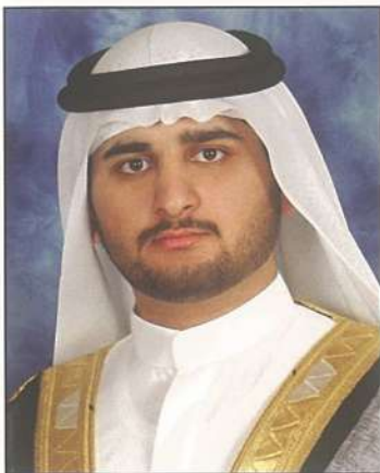
H.H. Sheikh Maktoum Bin Mohammed Bin Rashid Al Maktoum Deputy Ruler of Dubai