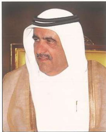
H.H. Sheikh Hamdan Bin Rashid Al Maktoum Deputy Ruler of Dubai Minister of finance, UAE