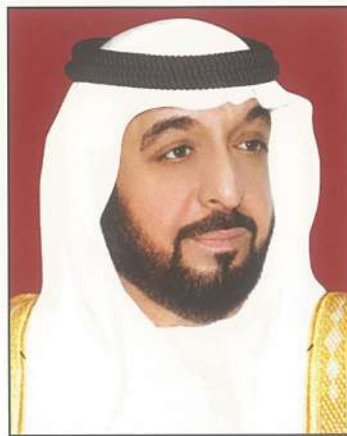
H.H. Sheikh Khalifa Bin Zayed Al Nahyan President of The UAE