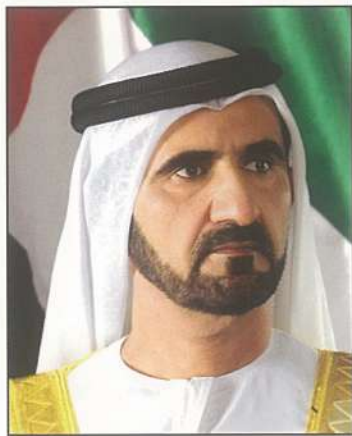
H.H. Sheikh Mohammed Bin Rashid Al Maktoum UAE Vice President and Prime Minister and Ruler of Dubai